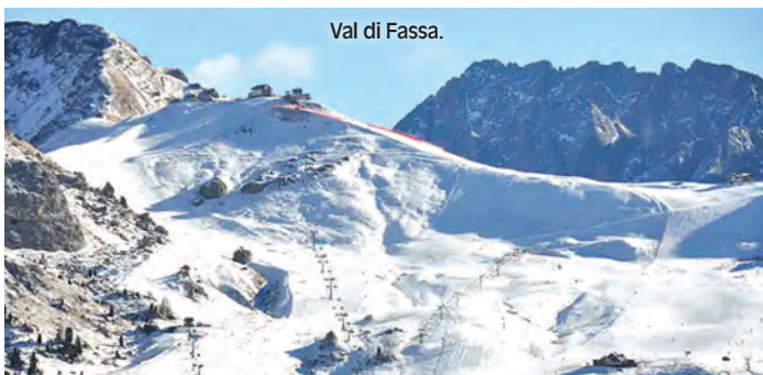
Val di Fassa.

Join us for a phenomenal ski and travel adventure to Val Di Fassa, Italy. Ski Sellaronda is in the Trentino area of the Dolomiti Mountains. The trip includes a three-night extension to Venice. The four-star accommodations include some meals, transportation, welcome party and more.