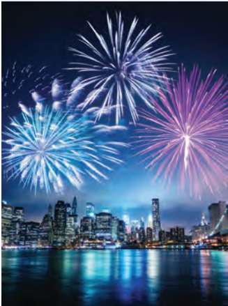
Independence Day July 4