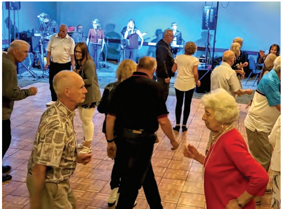
Dancing to the music of Sound Therapy at the June meeting.