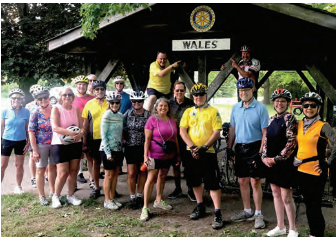
The first bike ride of the season: Waukesha to Wales on the Glacial Drumlin Trail.

July 2. No local ride due to the holiday.