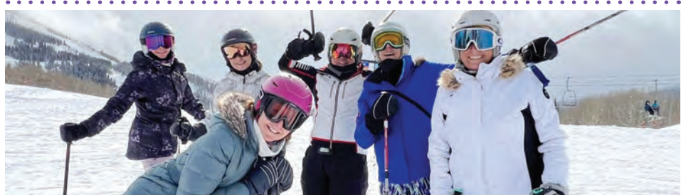
Start planning for next ski season, Page 5.