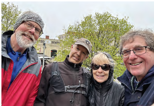
Milwaukee lakefront hike

June 27: 4-5 p.m. -- Happy Hour Walk. Greenfield Park. Meet in the parking lot along Lincoln Avenue just east of 124th Street in West Allis. Afterward, gather at Cleveland Pub, 124th St and Cleveland Avenue.