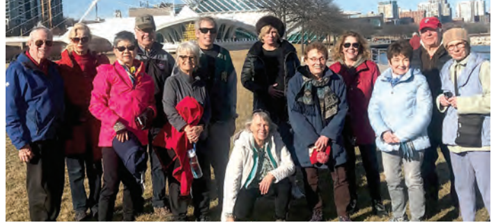
Hiking along the Milwaukee lakefront.

Meet at 1:30 p.m., hike from 1:45 to 3:45 p.m. Walk for the Fun – or Just for the Health – of It!