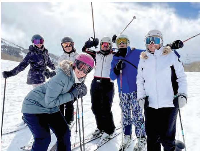
Girl power in the powder at Crested Butte.

Two of our three Western trips this year are completed: Crested Butte in January and Breckenridge in February. On March 11, the club will be taking a group to Park City, Utah. Based on reports from attendees, it has been a successful season!