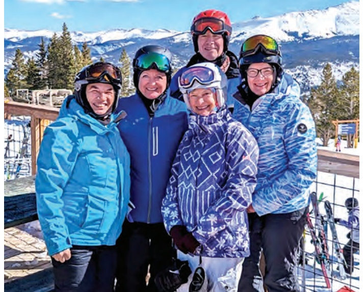
A sunny lunch on the deck at Breck.