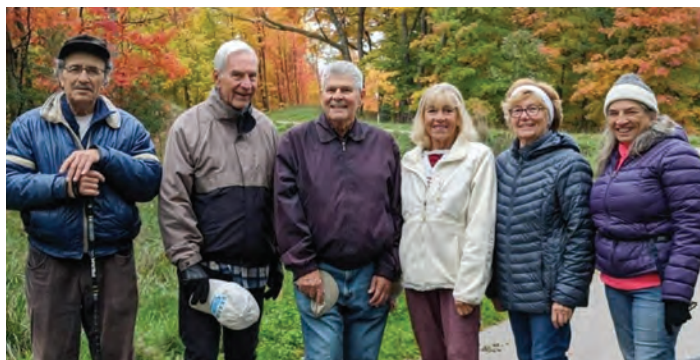
Hidden Lake Trail.

Our Thursday walks will not be scheduled during November and December. We do encourage everyone to get out and exercise with a walk on your own or with friends, even if nothing is formally scheduled.