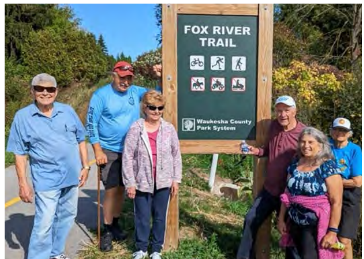
A weekday walk on the Fox River Trail.

Our Thursday walks will not be scheduled during November and December. We do encourage everyone to get out and exercise with a walk on your own or with friends, even if nothing is formally scheduled.