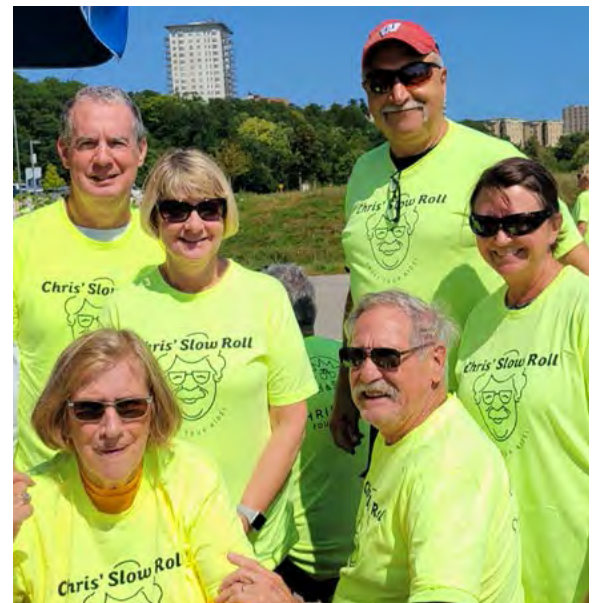
At the Chris Kegel Slow Roll.