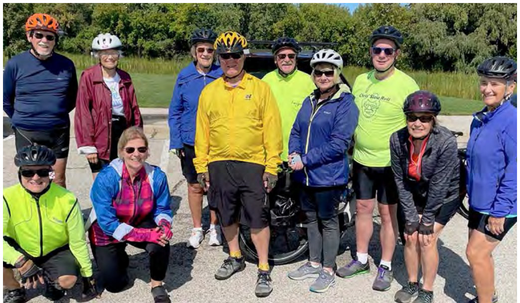
Bicyclists on the Oak Leaf Trail Southeast.