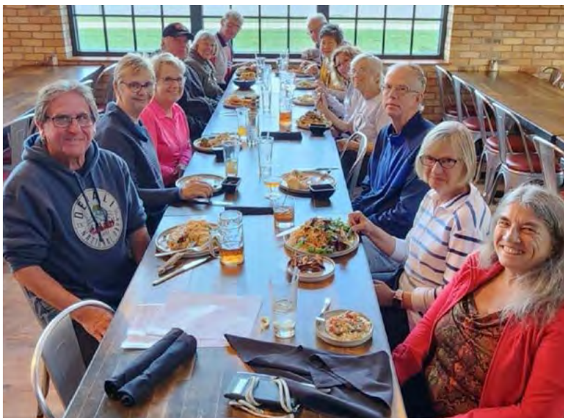
Refreshments in Oak Creek.