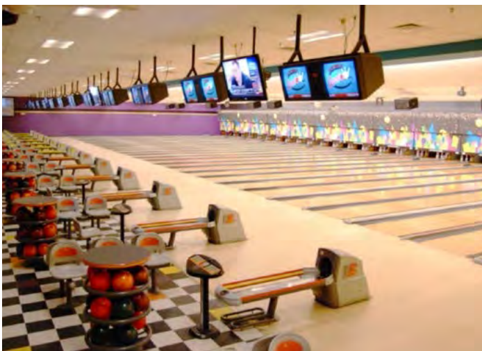
New Berlin Bowl