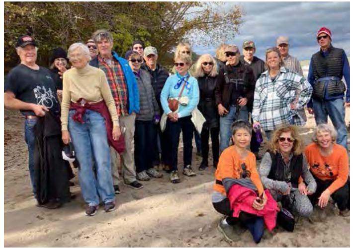
Grant Park hike.

Nov. 19 – Scuppernong Trails: This beautiful hike will be in the Kettle Moraine State Forest Southern Unit in Waukesha County. Parking at the trailhead is located on County Highway ZZ, east of Hwy 67 and north of the village of Eagle: address for your map app is S58 W35820 County Road ZZ, Dousman 53118. The trail is considered intermediate to advanced due to the uneven surface, some inclines and rocks/stones in some places. Gather at Sports Page Bar and Grill afterward for food and drinks. Hike Leaders: Joyce Szulc and Jim Stephens . Questions? Call Joyce at (262) 902-3248.