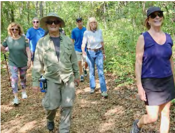
In the woods at Nashotah Park.

Feb. 10-17 (Saturday – Saturday) • $2,170