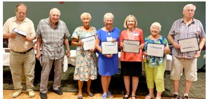
New inductees into the 80/30 Club