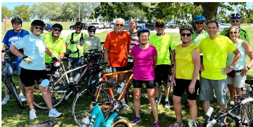
Whitnall Park on Labor Day weekend.