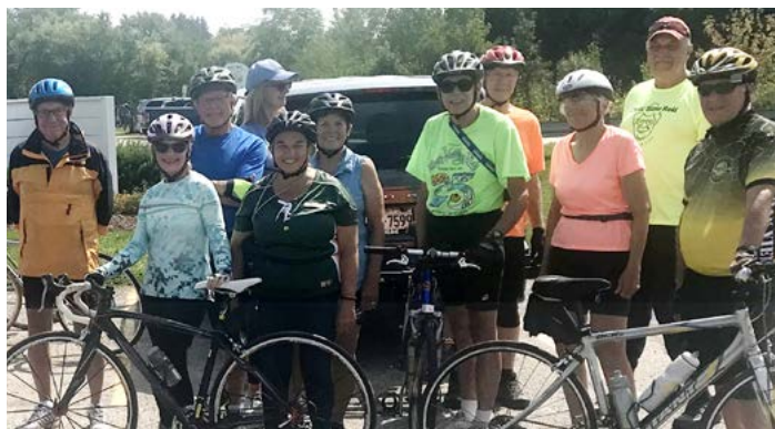
Biking on the Pike River Pathway.