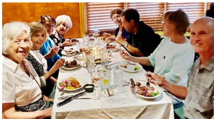
Dinner at the Steakout in August.

Because of the club's travels in October, we are scheduling Over the Hump on the fourth Wednesday of the month, rather than the third. We will meet at Mo's Irish Pub, 10842 W Bluemound Road, from 4 to 7 p.m. We have a special area to meet. Come and socialize with your fellow Vags. (Happy Hour is 3-6 p.m. if you are interested.)